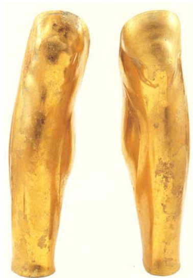
Fig. 4: Derveni Tomb A, the second pair of bronze greaves found inside the tomb (after Themelis and Touratsoglou 1997, pl. 7 A15)