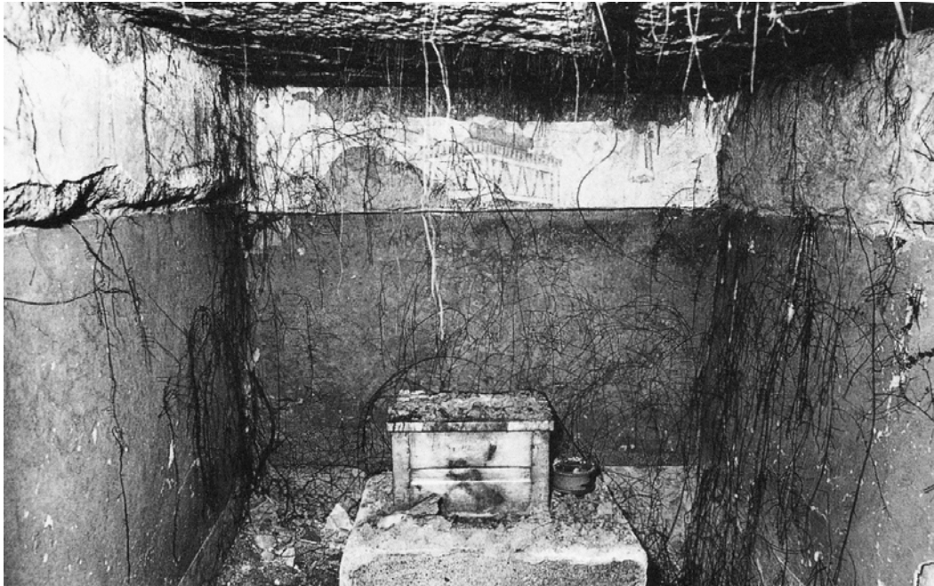
Fig. 5: Agios Athanassios, the interior of the tomb with the silver-plated larnax in the forefront and on the opposite wall the papyri on top of a box (after Tsimbidou-Avloniti 2000, 568 fig. 2)