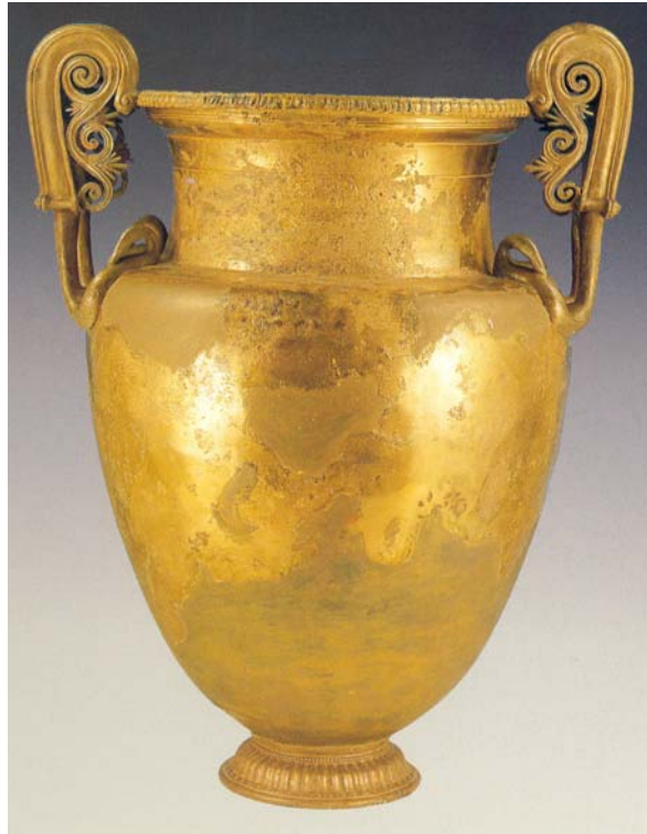
Fig. 3: Derveni Tomb A, the bronze krater inside which the remains of the deceased were laid (after Themelis and Touratsoglou 1997, pl. 1 A1)