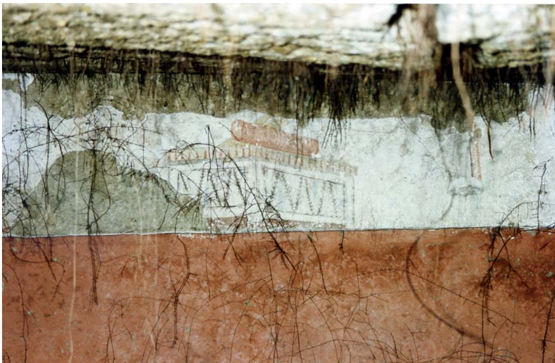
Fig. 6: Agios Athanassios, detail of the papyri on top of a box