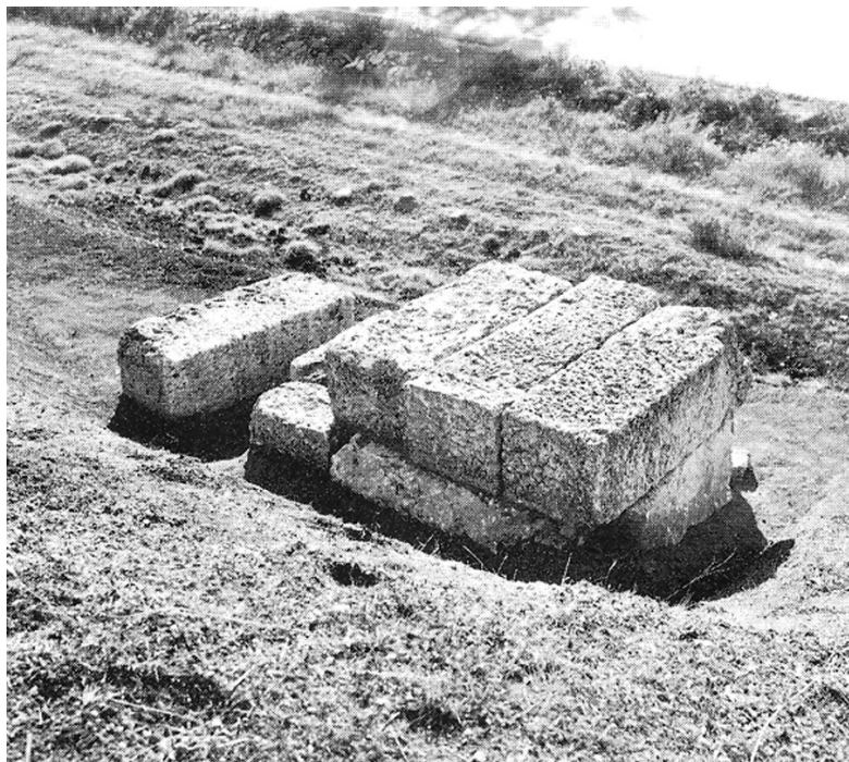
Fig. 1: Derveni Tomb A, the slabs covering the tomb on which whatever remained of the pyre was strewn, among them PDerveni (after Themelis and Touratsoglou 1997, 28 fig. 5)